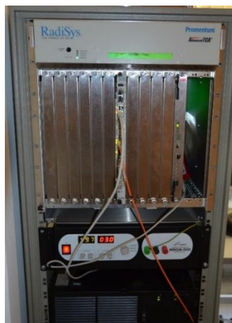
Figure 2. Test setup with a RadiSys Promentum ATCA Sys-6010 crate with Dual Star backplane instrumented with a FPGA test board (right most board), a 10 GbE RadiSys ATCA-2210 switch blade (centered board) and a dual Intel Xeon QuadCore based PC with four dual-port 10 GbE Myricom 8B2-2S (bottom) network interface cards.

The test setup with all its components is depicted in Figure 2 while a schematic can be seen in Figure 3. The ATCA boards are housed in a RadiSys Promentum ATCA Sys-6010 crate with Dual Star backplane [12]. Inside the crate one data processing board populated with a Xilinx Virtex 5 XC5VFX70T FPGA [13] simulates the LAr calorimeter off-detector electronics. The high-speed data link to the PC is realized through the communication over the backplane with a 10 GbE RadiSys ATCA-2210 switch blade [14] inside the same ATCA crate which forwards the data through optical fibers to a PC equipped with two Intel Xeon QuadCore X5550 CPUs with 2.67 GHz [15], 24 GB RAM and four dual-port 10 GbE Myricom 8B2-2S network interface cards [16].